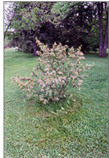
Black Chokeberry in bloom