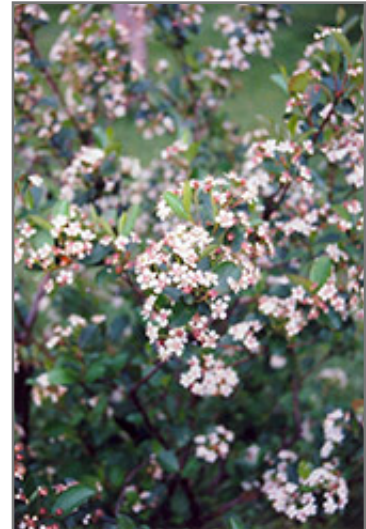
Black Chokeberry flowers