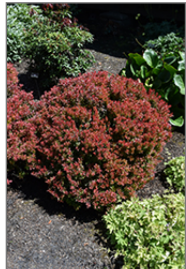
Golden Ruby Barberry