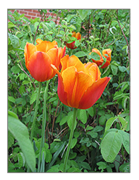
Apeldoorn Elite Tulip flowers