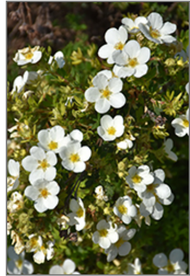
McKay's White Potentilla flowers