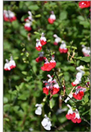
Hot Lips Sage flowers

Hot Lips Sage is a fine choice for the garden, but it is also a good selection for planting in outdoor pots and containers. With its upright habit of growth, it is best suited for use as a 'thriller' in the 'spiller-thriller-filler' container combination; plant it near the center of the pot, surrounded by smaller plants and those that spill over the edges. It is even sizeable enough that it can be grown alone in a suitable container. Note that when growing plants in outdoor containers and baskets, they may require more frequent waterings than they would in the yard or garden.