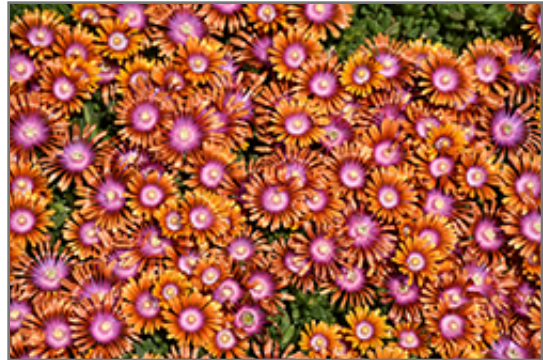
Fire Spinner Ice Plant in bloom

Fire Spinner Ice Plant is recommended for the following landscape applications;