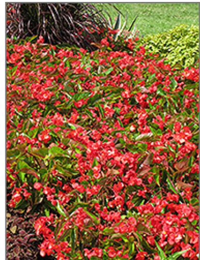
Dragon Wing Red Begonia in bloom