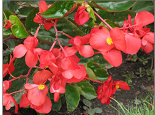
Dragon Wing Red Begonia flowers

Dragon Wing Red Begonia is an herbaceous annual with a trailing habit of growth, eventually spilling over the edges of hanging baskets and containers. Its medium texture blends into the garden, but can always be balanced by a couple of finer or coarser plants for an effective composition.