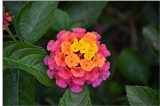
Lucky Sunrise Rose Lantana flowers

Lucky Sunrise Rose Lantana is recommended for the following landscape applications;