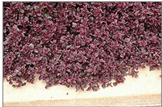
Purple Lady Blood Leaf