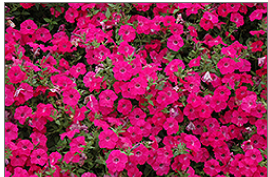
Tidal Wave Hot Pink Petunia in bloom