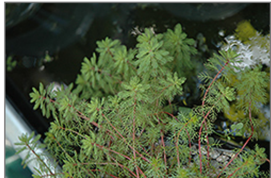
Red Stemmed Parrot Feather foliage