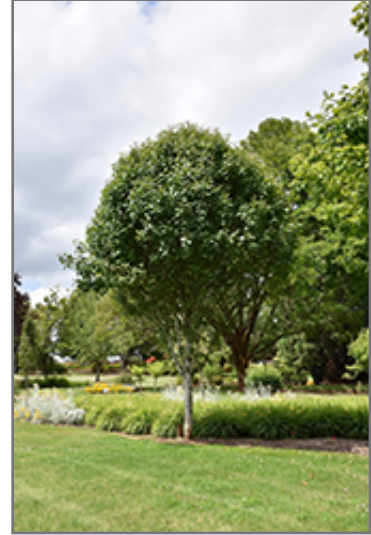
Jack Ornamental Pear

* This is a 'special order' plant - contact store for details