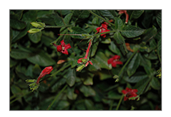
Ragin' Cajun Hardy Petunia flowers

This variety is quite adaptable, tolerating full or partial sun and moist to dry conditions in any kind of soil; vivid red flowers massed above mounded green foliage all season; excellent in containers, or as a low border front