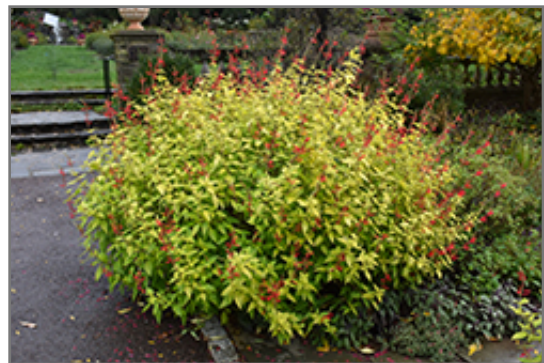
Golden Delicious Pineapple Sage in bloom