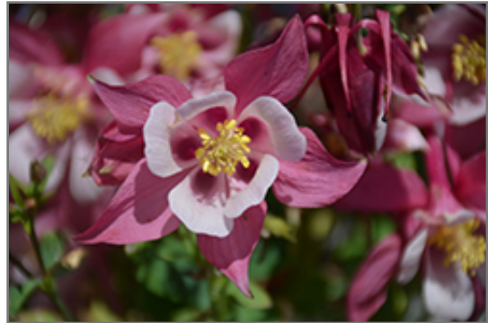
Origami Rose and White Columbine flowers

Origami Rose and White Columbine is recommended for the following landscape applications;