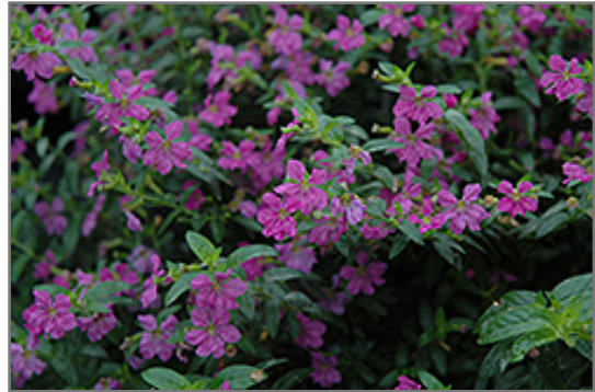
Allyson Mexican Heather flowers