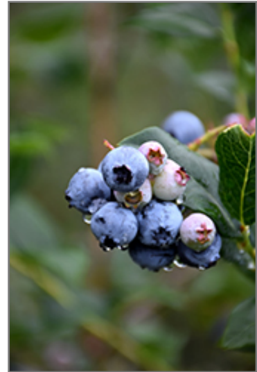
Chippewa Blueberry fruit

Chippewa Blueberry features dainty clusters of white bell-shaped flowers with shell pink overtones hanging below the branches in mid spring. It has green foliage throughout the season. The glossy oval leaves turn an outstanding orange in the fall. It features an abundance of magnificent blue berries in mid summer.