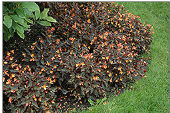
Sparks Will Fly Begonia in bloom