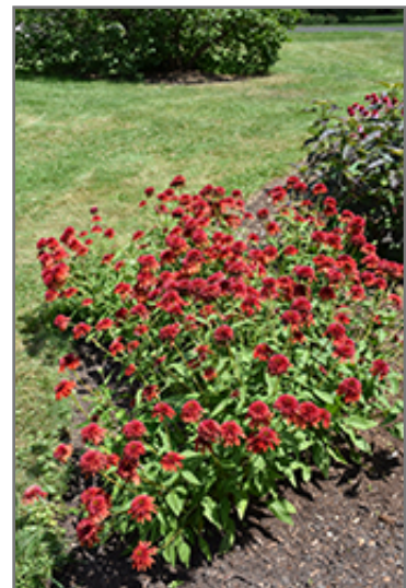
Double Scoop Orangeberry Coneflower in bloom