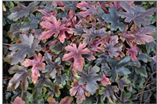
Brass Lantern Foamy Bells

Brass Lantern Foamy Bells is recommended for the following landscape applications;