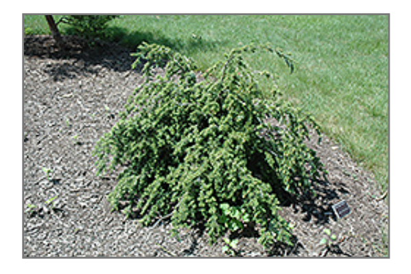
Gracilis Japanese Hemlock