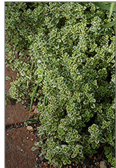
Aureus Lemon Thyme foliage