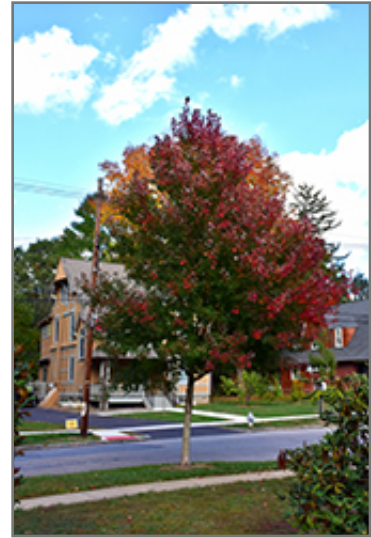
Redpointe Red Maple in fall

This tree should only be grown in full sunlight. It is quite adaptable, preferring to grow in average to wet conditions, and will even tolerate some standing water. It is not particular as to soil type, but has a definite preference for acidic soils, and is subject to chlorosis (yellowing) of the leaves in alkaline soils. It is somewhat tolerant of urban pollution. This is a selection of a native North American species.