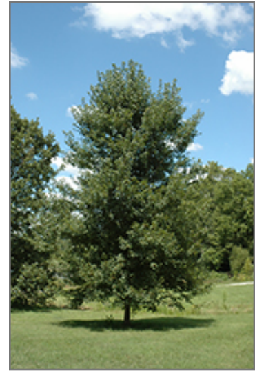
Redpointe Red Maple

Redpointe Red Maple is recommended for the following landscape applications;