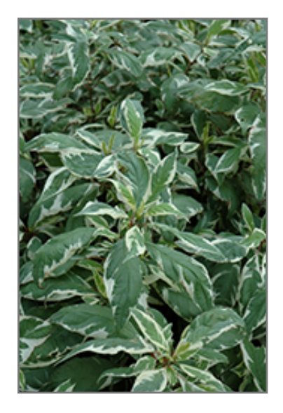
Cream Cracker Dogwood foliage

Cream Cracker Dogwood is a multi-stemmed deciduous shrub with a more or less rounded form. Its average texture blends into the landscape, but can be balanced by one or two finer or coarser trees or shrubs for an effective composition.