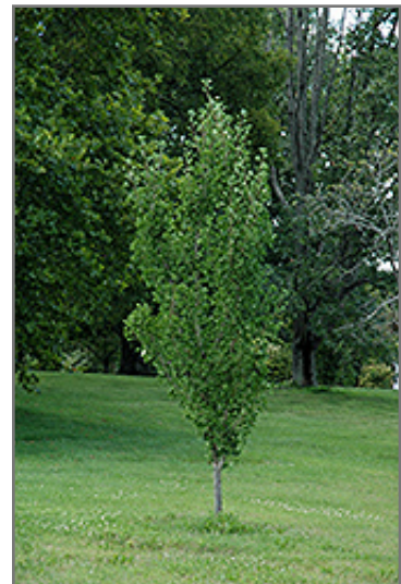
Presidential Gold Ginkgo