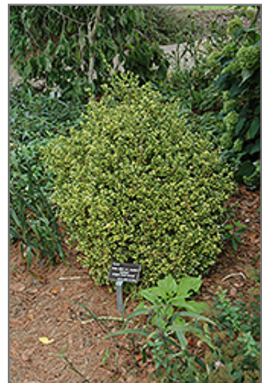
Sunburst Variegated Korean Boxwood