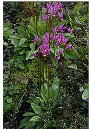
Shooting Star in bloom