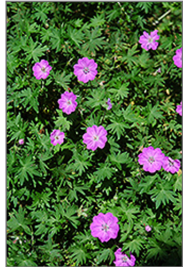
Bloody Cranesbill flowers

Bloody Cranesbill is recommended for the following landscape applications;