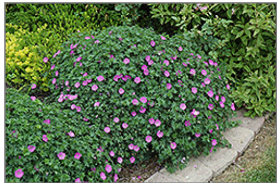
Bloody Cranesbill in bloom