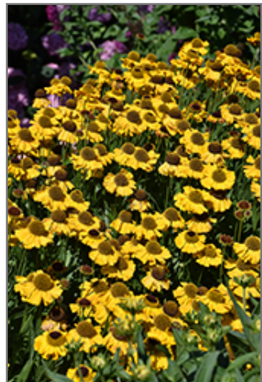
Wyndley Sneezeweed flowers