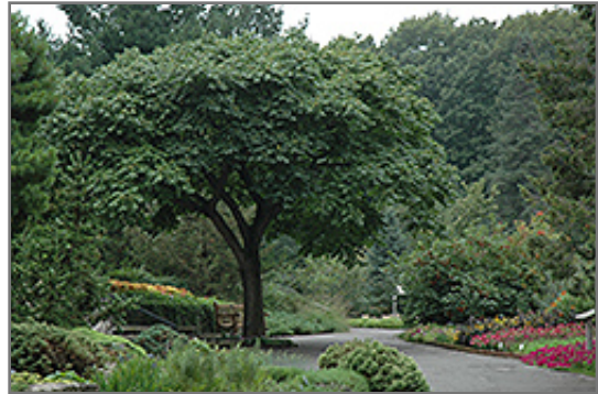
Amur Cork Tree