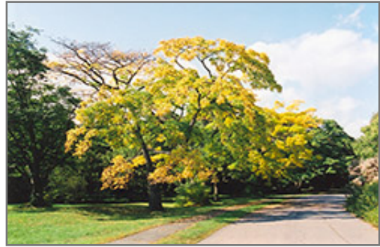
Amur Cork Tree in fall

This tree should only be grown in full sunlight. It is an amazingly adaptable plant, tolerating both dry conditions and even some standing water. It is not particular as to soil type or pH. It is somewhat tolerant of urban pollution. This species is not originally from North America.