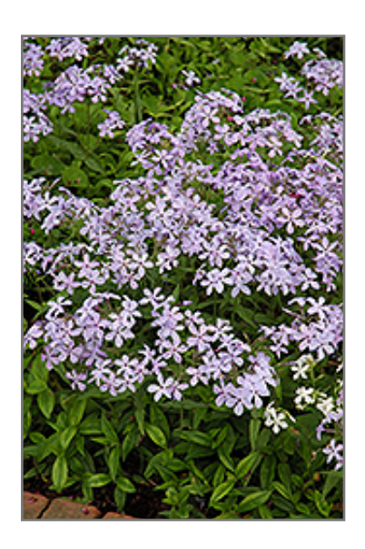
Woodland Phlox flowers

Woodland Phlox will grow to be about 8 inches tall at maturity, with a spread of 18 inches. When grown in masses or used as a bedding plant, individual plants should be spaced approximately 16 inches apart. Its foliage tends to remain low and dense right to the ground. It grows at a medium rate, and under ideal conditions can be expected to live for approximately 10 years. As an herbaceous perennial, this plant will usually die back to the crown each winter, and will regrow from the base each spring. Be careful not to disturb the crown in late winter when it may not be readily seen!