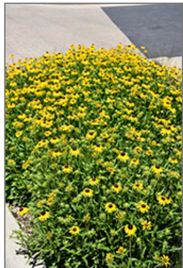
Viette's Little Suzy Coneflower in bloom