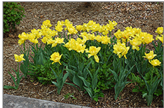
Monte Carlo Tulip in bloom