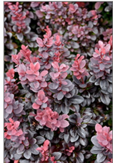
Concorde Japanese Barberry foliage