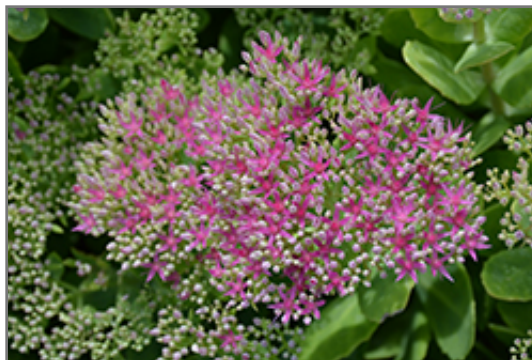
Neon Stonecrop flower buds

Neon Stonecrop will grow to be about 20 inches tall at maturity, with a spread of 20 inches. When grown in masses or used as a bedding plant, individual plants should be spaced approximately 16 inches apart. It grows at a fast rate, and under ideal conditions can be expected to live for approximately 15 years. As an herbaceous perennial, this plant will usually die back to the crown each winter, and will regrow from the base each spring. Be careful not to disturb the crown in late winter when it may not be readily seen!