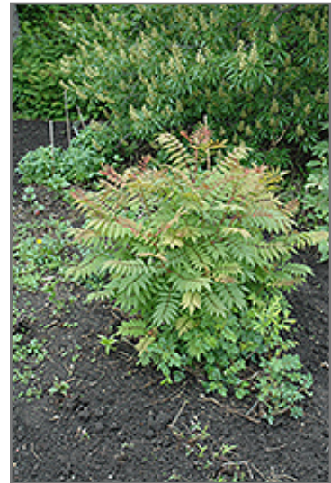
Sem False Spirea