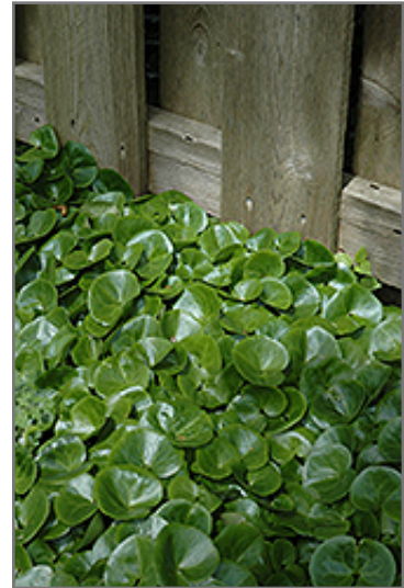
European Wild Ginger