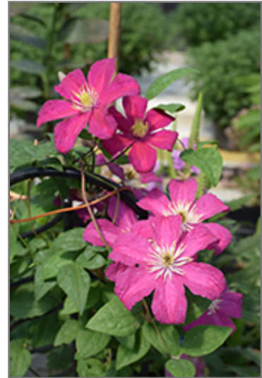
Barbara Harrington Clematis flowers