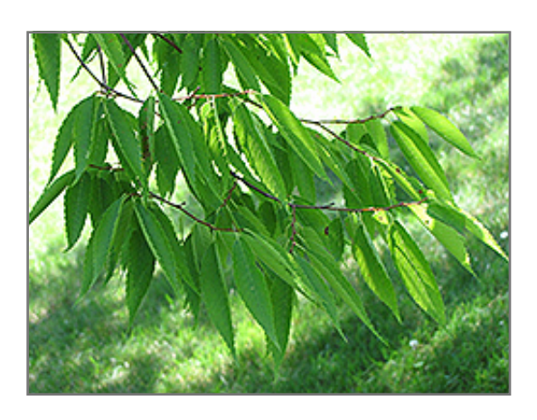
Japanese Zelkova foliage