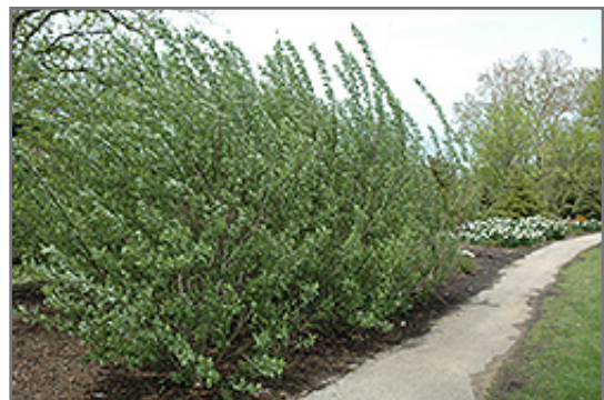
French Pussy Willow