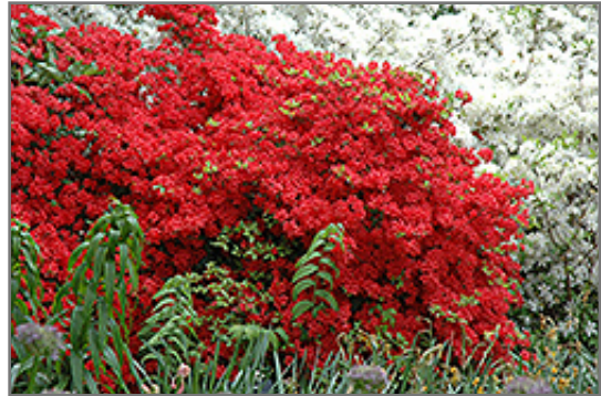
Stewartsonian Azalea in bloom