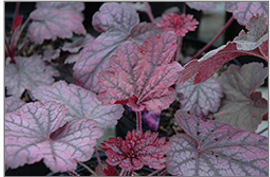
Midnight Bayou Coral Bells foliage

Midnight Bayou Coral Bells is recommended for the following landscape applications;