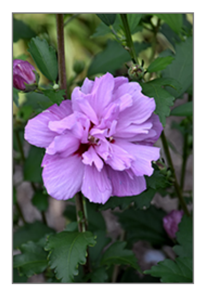
Ardens Rose of Sharon flowers