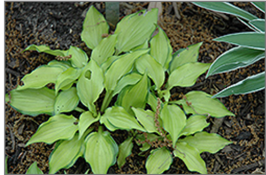
Cracker Crumbs Hosta