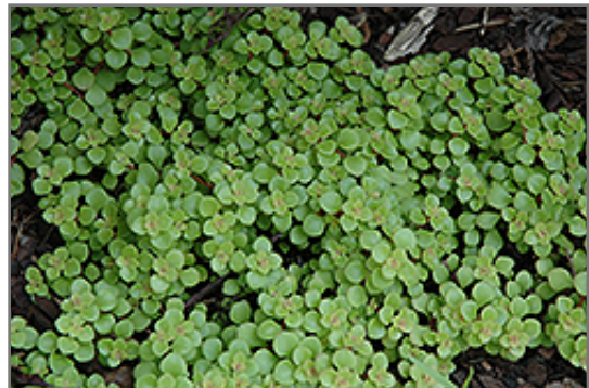
Golden Stonecrop