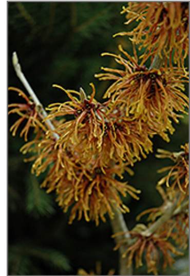
Jelena Witchhazel flowers

Jelena Witchhazel is recommended for the following landscape applications;