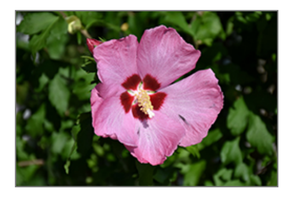
Aphrodite Rose of Sharon flowers

This is a high maintenance shrub that will require regular care and upkeep, and is best pruned in late winter once the threat of extreme cold has passed. It is a good choice for attracting butterflies and hummingbirds to your yard, but is not particularly attractive to deer who tend to leave it alone in favor of tastier treats. Gardeners should be aware of the following characteristic(s) that may warrant special consideration;