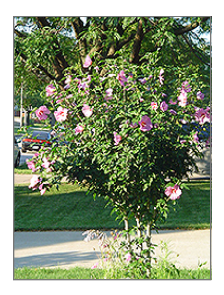
Aphrodite Rose of Sharon in bloom