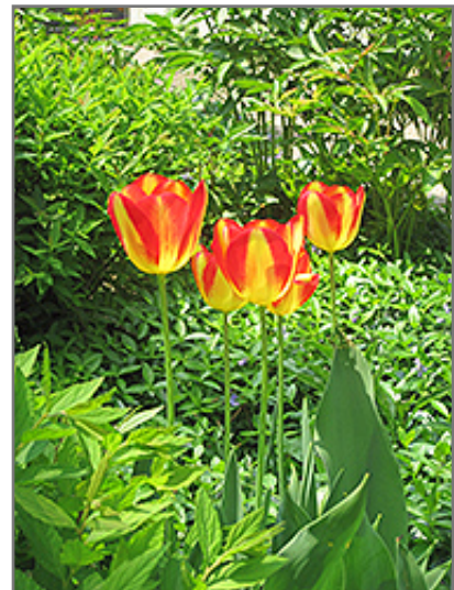
Antoinette Tulip in bloom