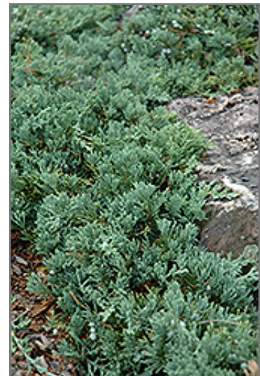
Blue Rug Juniper